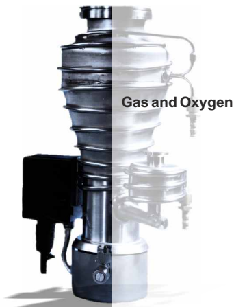
Gas and Oxygen